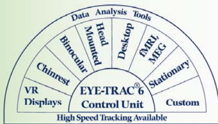
*All eye camera optics are configurable with control unit

Ability to pre-select the data collection parameters of interest, significantly reducing data analysis time.