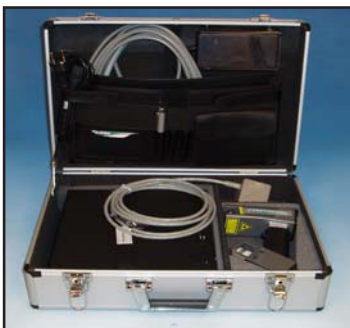
Entire COBRA system fits in compact carrying case

Allows for measurements in main display window to be calculated in millimeters or inches