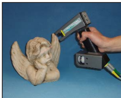
COBRA scanning wand