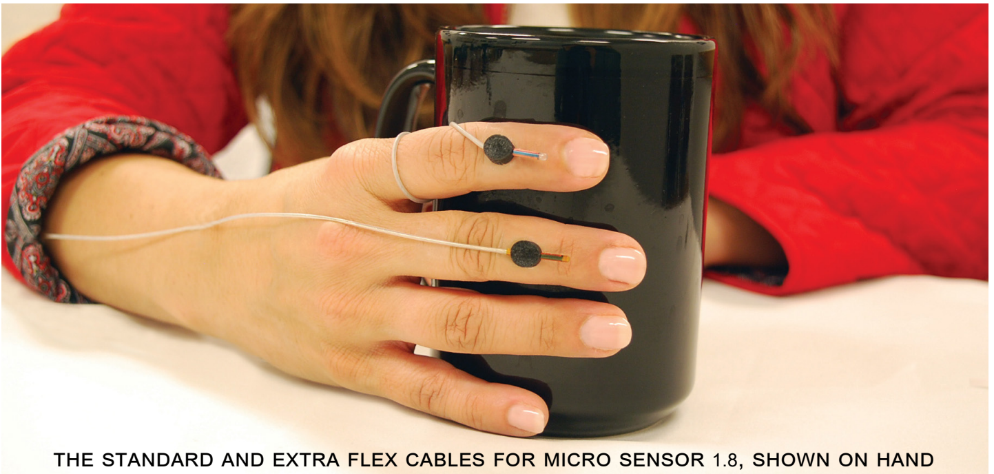
THE STANDARD AND EXTRA FLEX CABLES FOR MICRO SENSOR 1.8, SHOWN ON HAND