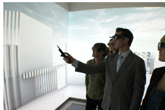
Visualize designs with your team via large scale 3D projections.

Collaboration: Tap into the power of social presence and review immersive 3D environments with small or large teams.