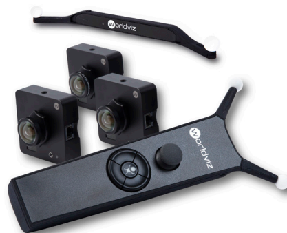
WorldViz PPT cameras enable sub-millimeter precision tracking within large, walkable spaces.

3D Projectors: Two high quality short-throw projectors to immerse large audiences in virtual environments with zero footprint.